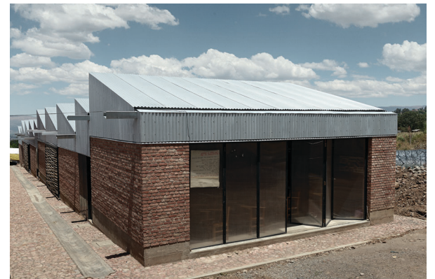
Landwirtschaftsschule Bella Vista Bolivia dbXchange Winner