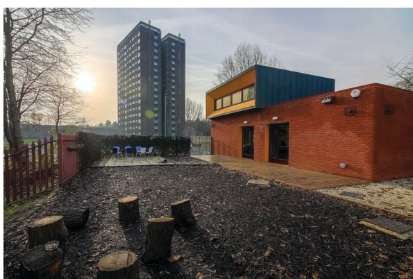
New Wortley Community Centre United Kingdom Live Projects Network Winner