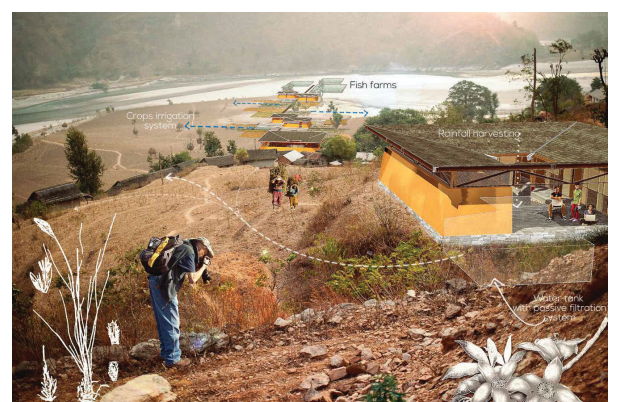
The Vertical University Project Nepal SEED Network Winner

For the first time, these three international networks combined to support and promote systemic change in the practices of design with the intent of building on the common ground they share.