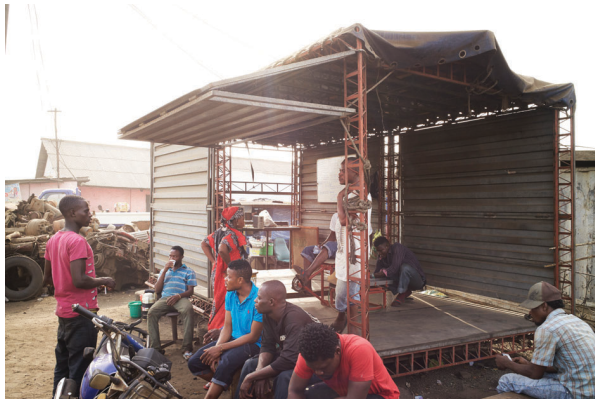
Agboglobshie Makerspace Platform Ghana SEED Network Winner

Design Corps, the Social Economic Environmental Design (SEED), designbuildXchange, and Live Projects Network in collaboration with the Center for Public Interest Design, are pleased to announce the 2017 Awards winners to recognize excellence in public interest design. Two winners were selected from each of the three networks to represent their public interest design principles and selection criteria. The winners are: